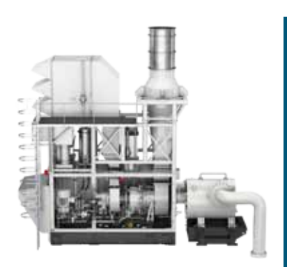
Common modular package design for mechanical drive applications